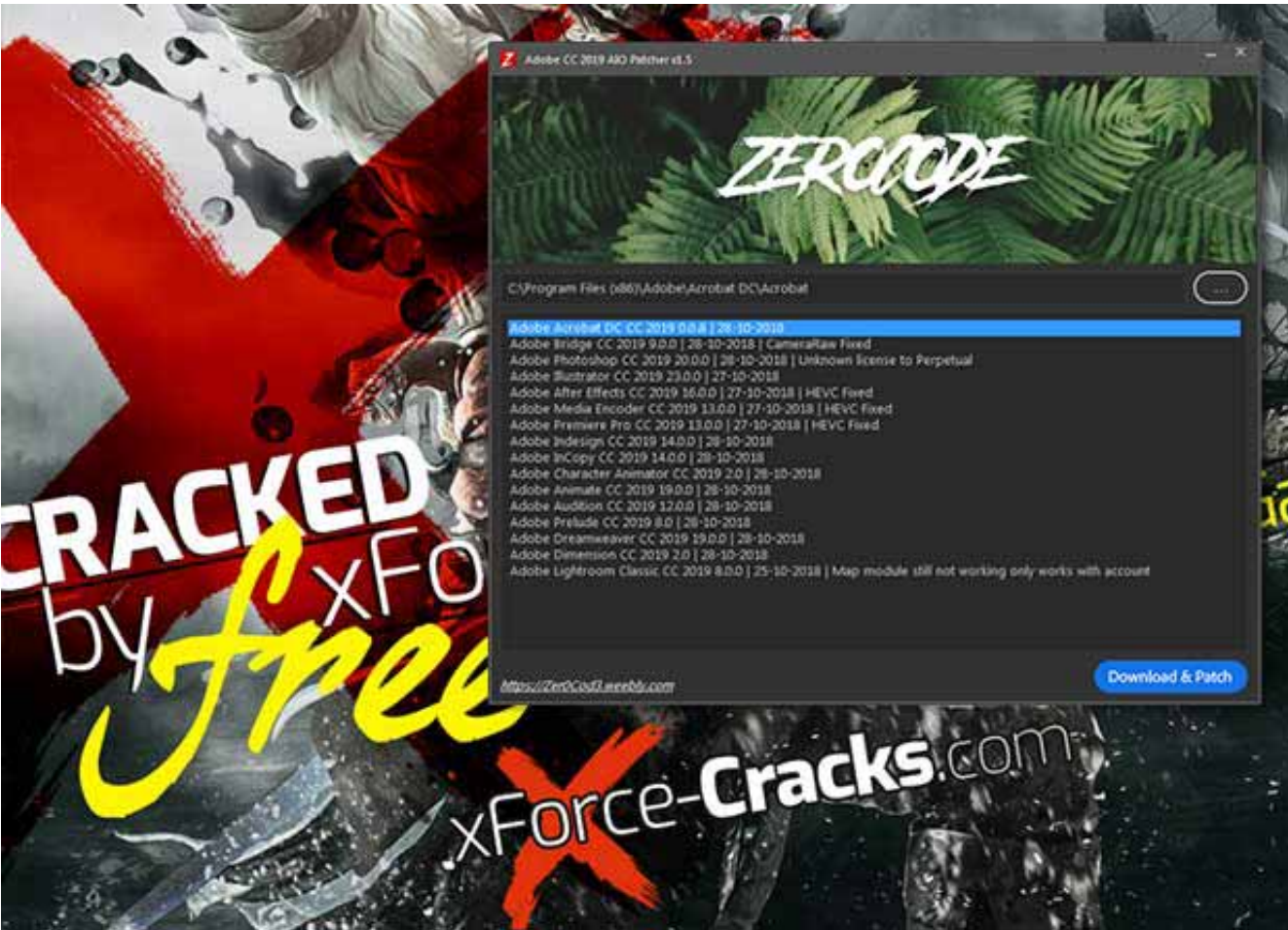
Adobe CC 2019 All In One (AIO) Patcher V1.5