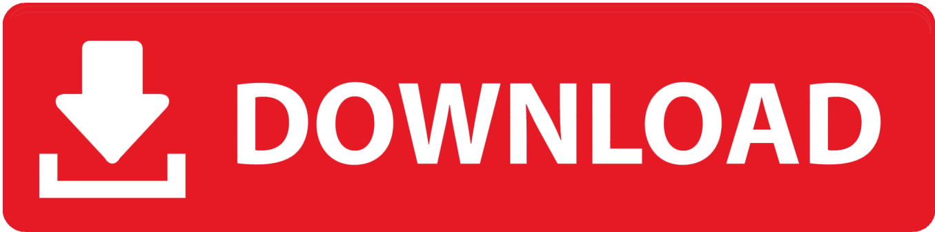
Adobe CC 2019 All In One (AIO) Patcher V1.5